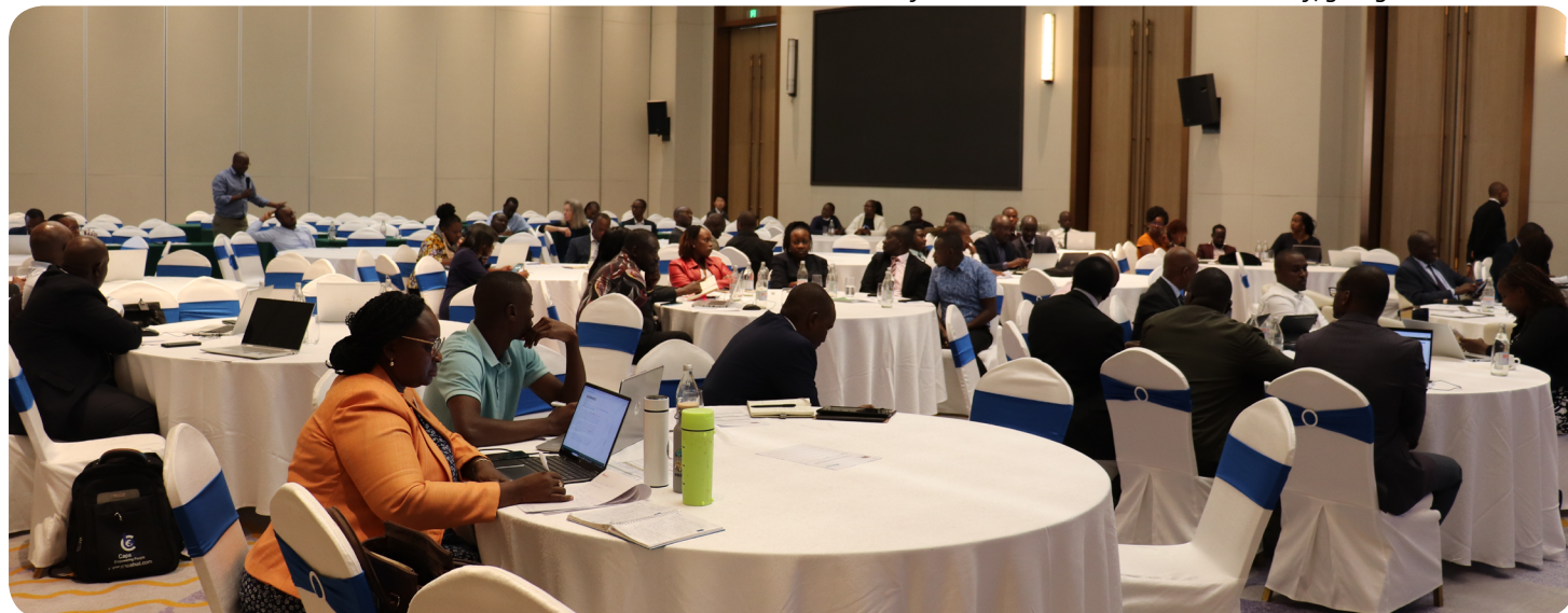
Photo of the Attendees during the meeting