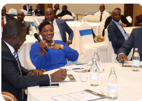
Nakhumicha Wafula, Cabinet Secretary of Health, giving her remarks.