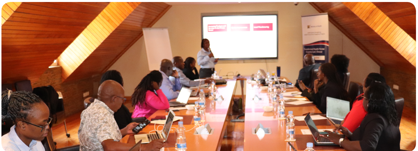
Photo of the Attendees during the meeting