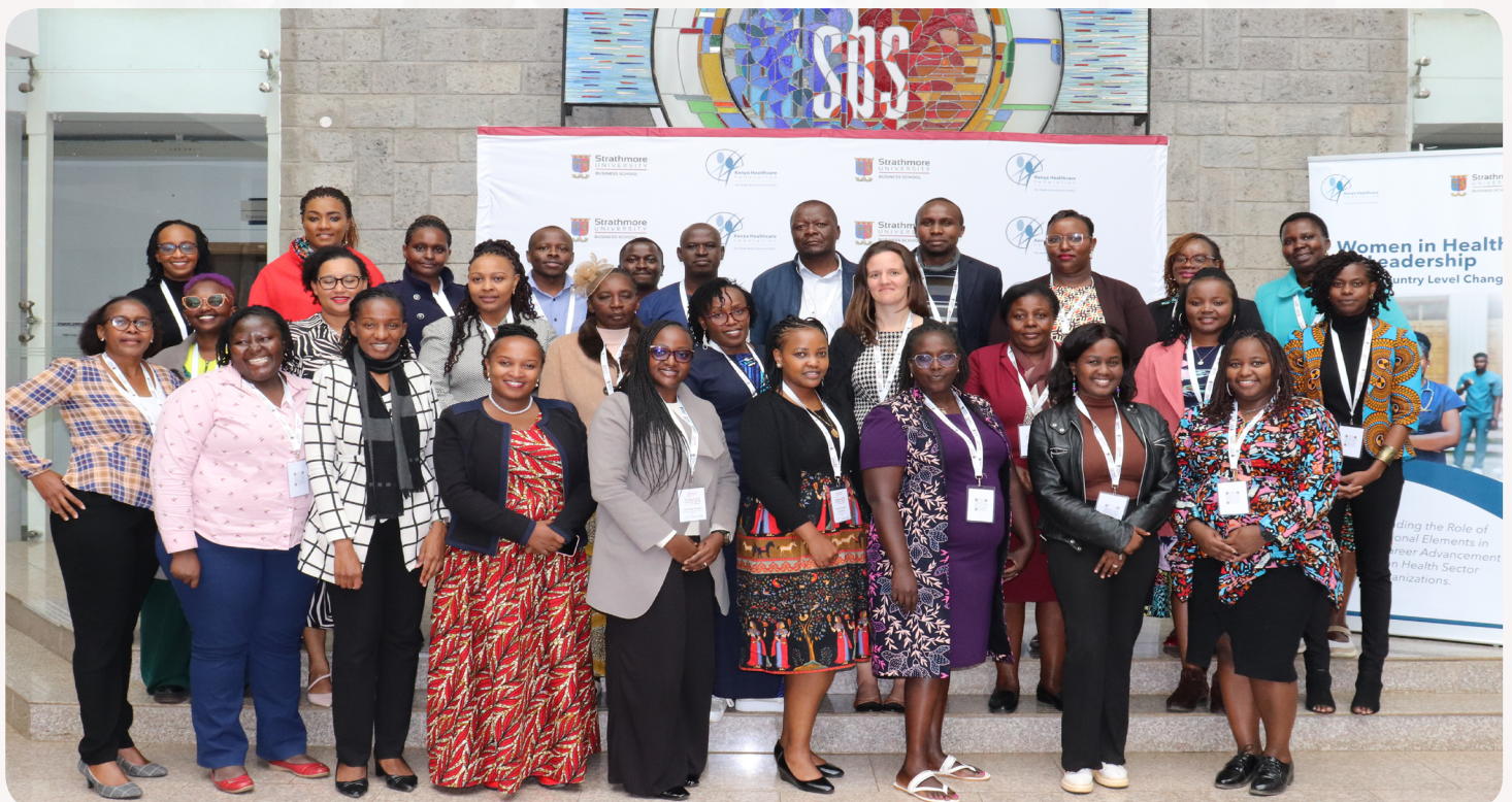
Health session attendees at the HR summit

By implementing strategic mentoring and coaching programs, healthcare organizations can foster a culture of continuous learning and development, driving both individual and organizational success in Kenya's evolving healthcare landscape.