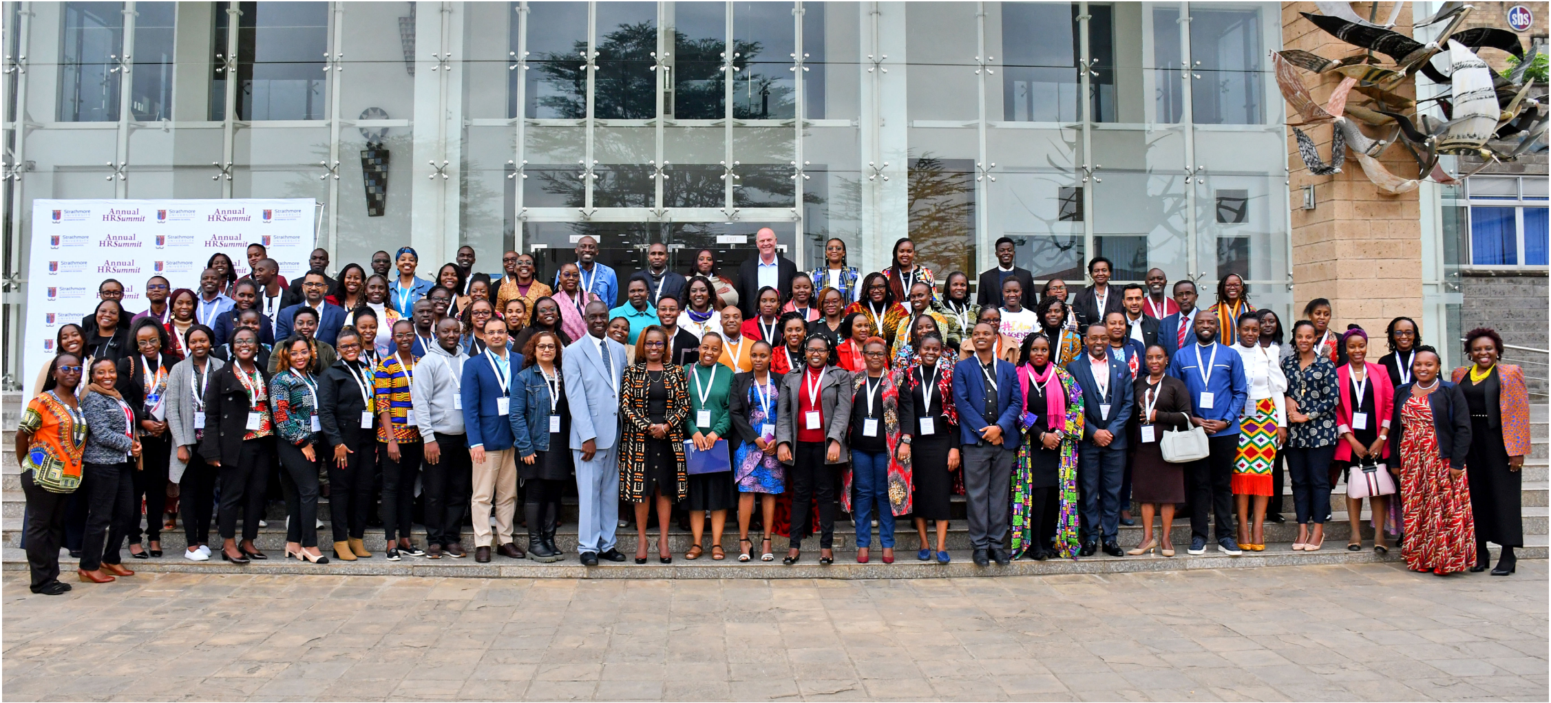
High-level delegates at the HR summit