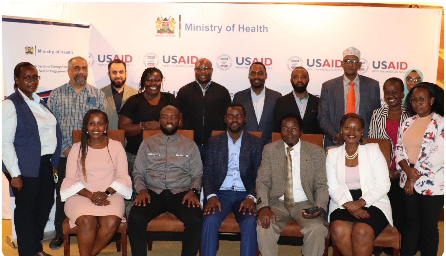
Attendees posing for a group photo

As this collaborative effort progresses, we are pleased to announce that we will be in Mombasa county in August, furthering our mission to strengthen healthcare provision through devolution across Kenya.