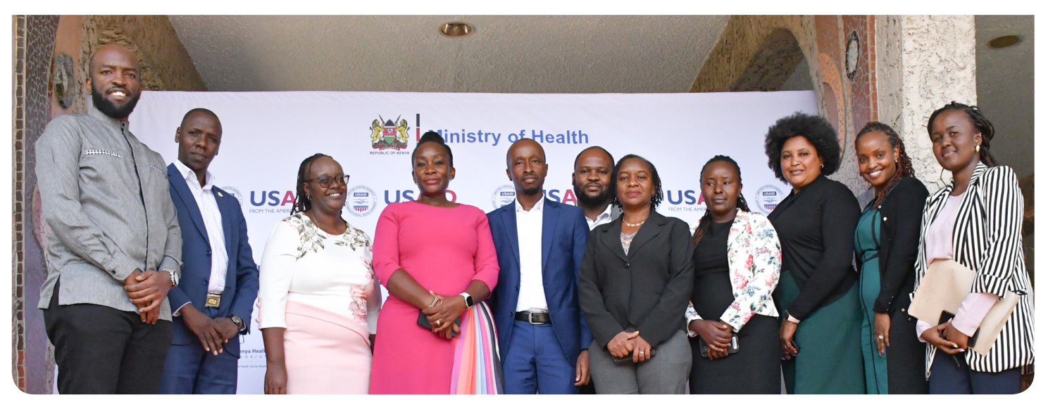
Attendees posing for a group photo