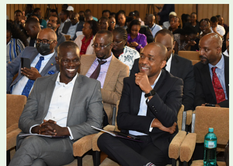
Healthcare professionals from NGOs, private sector and other stakeholders participating in the East Africa Health Expo 2022