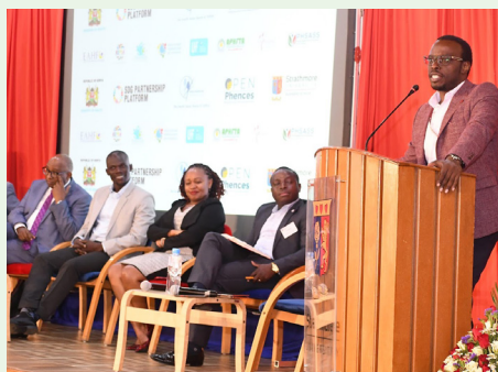
Panel discussions and presentations during the East Africa Health Expo 2022