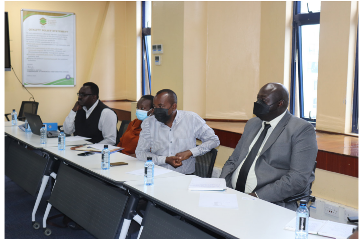
KHF Members present during the deliberations with IRA