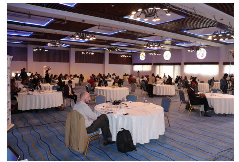
Participants attending the KHF Members Meeting