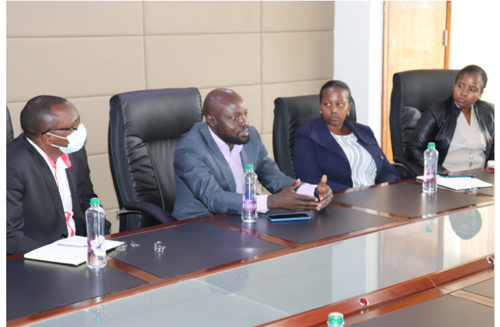
KHF Members present during the deliberations with PCF