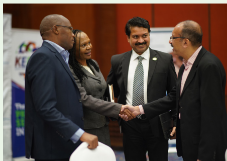
Member Engagements during the CEO's Forum