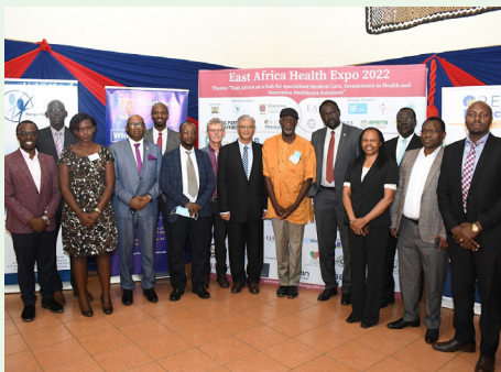
Partners present during the East Africa Health Expo 2022

Day two and three discussions revolved around Public-Private Partnerships in the health sector, how to make strategic investments in health, research and education in the health sector with inspirational presentations among the partners present.