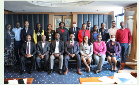
NHIF representatives together with Kenya Healthcare Federation at the meeting.