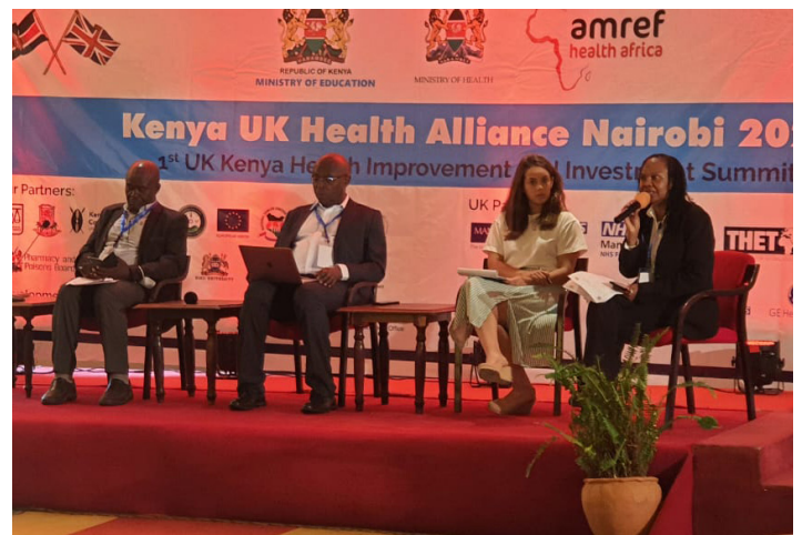
Panel Session during the 1st Kenya UK Health Alliance.