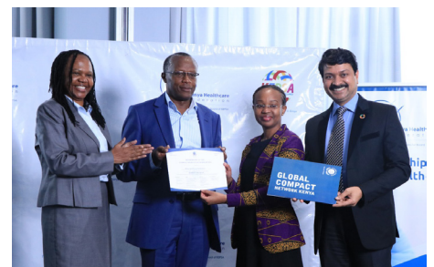
Kenya Healthcare Federation has taken the initiative to join the UN Global Compact.