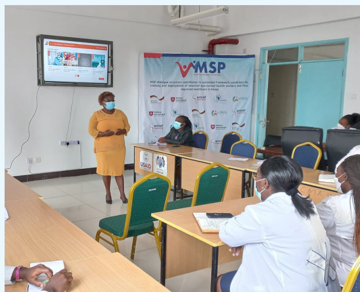
Presentations made during the MSP 2.0 Engagement.

The Forums provided an opportunity to create awareness on the Specialized Health Professionals. Thus, creating a Robust Stakeholder Network that supports the optimization of training and deployment of the Specialized Health Professionals.