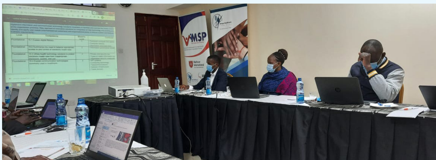
Presentations made during the MSP 2.0 Engagement.