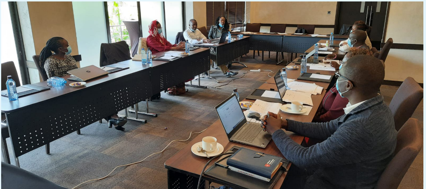
MSP 2.0 Team including the representatives of County Health Management Team and KHF.