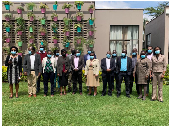
Group Photo of representatives from MSP, CHESOA and Training Institutions.

On July 27th 2021, MSP Program held a forum to identify gaps in the training framework for the Community Health Professionals. This forum brought together representatives from Training Institutions and Community Health Services and Development Officers Association (CHESOA).