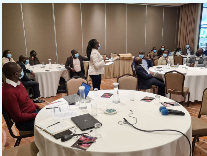
Presentations made during the MSP 2.0 Engagement.

There was an emphasis of having standards to guide the training of Community Health Professionals. Purposeful efforts towards the harmonization of the design of courses at the institutions will ensure the highest standards of training are achieved. This will be very critical in ensuring that formal recognition and regulation is realized.