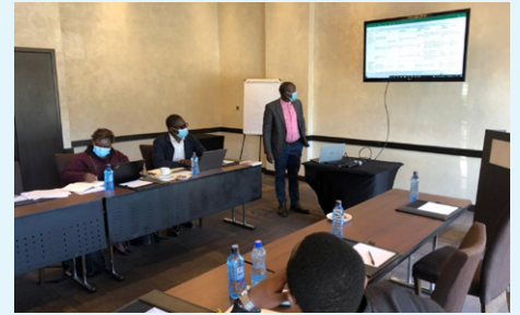
Presentations made during the MSP 2.0 Engagement.

Engagement of Stakeholders at the National and County level will help drive the unregulated cadres towards formal recognition and regulation.