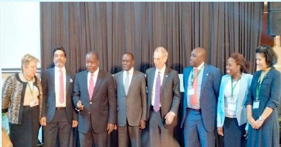
CS Health, CS Education, US Ambassador and AEF Leadership team during the launch