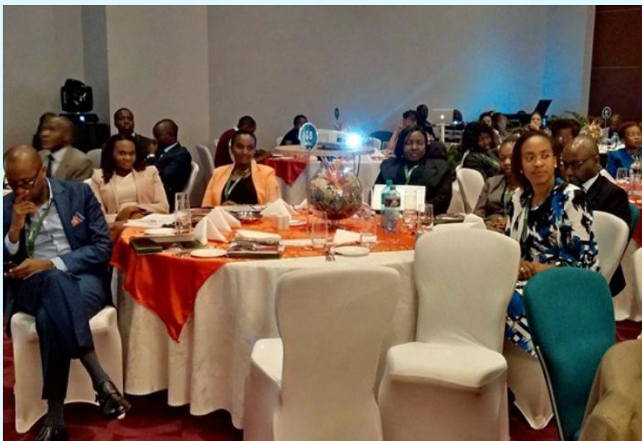
KHF Board of Directors and members at the AEF Launch

Speaking during the official launch of the fund, the Health cabinet secretary Dr Cleopa Mailu says the initiative will go a long way in addressing shortage of human resource in the health sector as well as improve on the services offered.