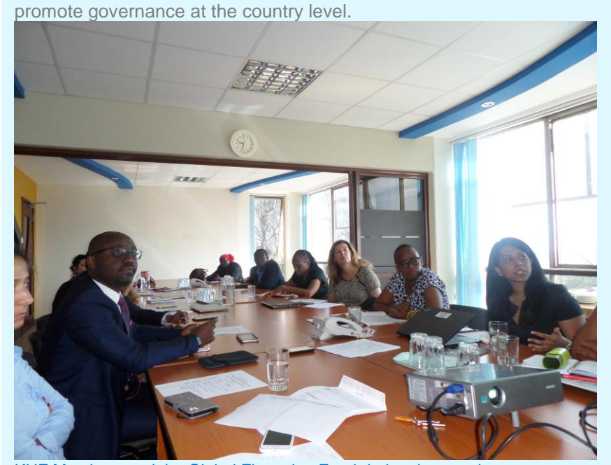
KHF Members and the Global Financing Fund during the meeting

The GFF team accompanied by the IFC World Bank as their key partners in Kenya presented the country's powered investment for every woman every child, highlighting the broad context of the changing financing landscape and how the paradigm has shifted creating a need for new model of development finance. The main aim of the fund is to bridge the funding gap for women's, adolescents', and children's health, handle quality investment cases with aligned financing and