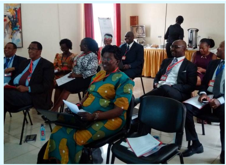
Kenya Healthcare Federation Leadership and the County CECs

In the last CSF meeting held at Pride Inn Hotel Westlands in April 2017, KHF and the CECs present agreed upon three major public private partnership areas from the Sustainable Development Goals that can help support contribution to the country's GDP and enable comparison to the global average.