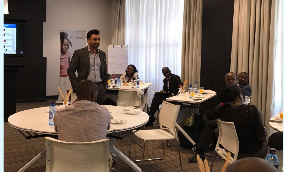
KHF Healthcare Financing committee members during the meeting. Association of Kenya Insurers (AKI), are among the forums that have been mobilized to work towards improving the provider payer relationship. AKI members are already adopting technological ways of accepting online submission of claims from providers. With this improvement payers are taking much lesser time to pay claims.

The meeting took place at Royal Tulip Hotel Nairobi and brought together leading ICT companies, payers and providers within the KHF umbrella on 23rd March 2017. The meeting deliberated on the overview of the Kenya healthcare financing industry and its significant growth from the large and small firms compared to East Africa. The ICT gaps within the healthcare space, that still allow manual entries and submissions of hardcopy claims has slowed down growth in healthcare financing and has led to high cost of healthcare. The providers and payers are ready to harmonize their codes and embrace various IT solutions to lower the cost of healthcare. There is a significant improvement in procedures and provider payer relationship with the ongoing KHF engagements. Since January 2017 after the first KHF provider payer meeting, the issue of overdue amount has reduced by 50%.