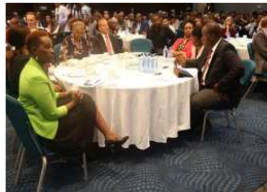
KEPSA Members during the breakfast meeting with Cabinet Secretary Dr Fred Matiangi at Radisson Blu Hotel

Moreover, the Principal Secretary for Immigration, is under instructions to facilitate the speed issuance of the documents and gave out his personal number for direct contact if applicants experience hitches.