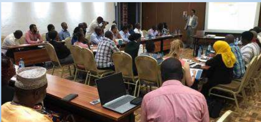
Kenya Healthcare Federation Team in Mombasa during the county Stakeholder engagement

Kenya Healthcare Federation (KHF) has successfully implemented county stakeholder forum in three counties they include; Makueni, Kirinyaga and Mombasa, these forums have been supported by a grant from the Business Advocacy Fund grant. This counties are among the seven counties that are to be covered.