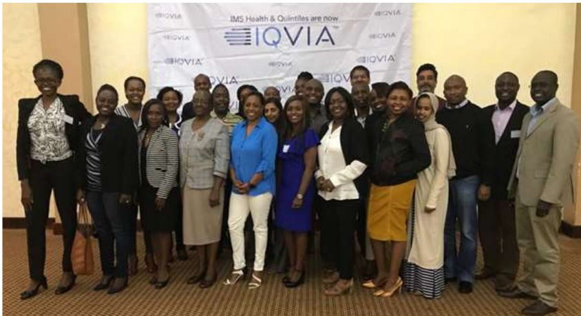
IQVIA and Kenya Healthcare Federation Team during the launch

IQVIA held a breakfast meeting on 11 th May 2018, at Prideinn Hotel in Westlands. The main agenda was a pre-launch of IQVIA HCP virtual space (a digital technology platform dedicated for healthcare professionals). - The key objective of the pre-launch was to gather views from different healthcare professionals under the umbrella of Kenya Healthcare Federation, on the digital technology platform.