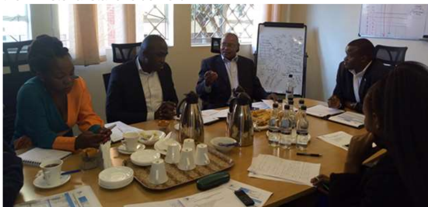
Human Resource for Health Committee Members during the meeting at Kenya Healthcare Federation