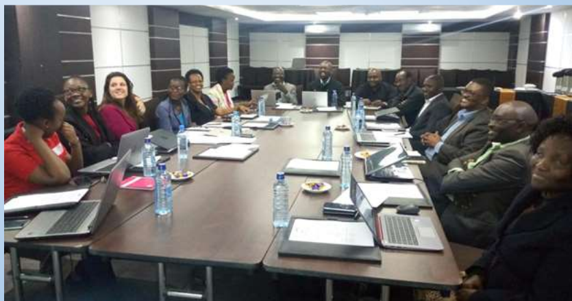
Community Health Volunteers engagement at Four Points Hotel by Sheraton – Hurlingham

The Multi Stakeholder Partnership (MSP) held an engagement with community health volunteers(CHVs) stakeholders at Four Point Hotel Sheraton on 14 th June 2018. The engagement aimed at strategizing on how the CHVs can be strengthened and recognized either through establishing an association or strengthening the existing one if there is already one. The meeting was well attended by different organizations including; Ministry of Health, Kenya Medical Training College, Living Goods, The Nairobi Hospital, Kenya Medical Women Association, Norvatis Social Business, IntraHealth International, Amref Health Africa, Malteser International and Kenya Healthcare Federation.