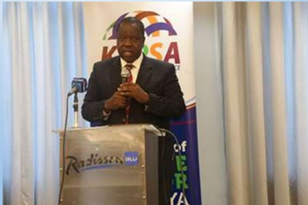
Dr Fred Matiang'i, Cabinet Secretary - Ministry of Interior and Coordination of National Government, speaking during the meeting with Kenya Private Sector Alliance.

Kenya Healthcare Federation (KHF) Members participated in a meeting with the Cabinet Secretary for interior and coordination of National Government, Dr. Fred Matiang'i. The meeting that was organized by KEPSA was held on 29 th June 2018 at Radisson Blue Hotel in Upper Hill, Nairobi. The main Agenda for the meeting was to discuss issues on immigration, citizenship, work permits & passport application, renewal and processing time.