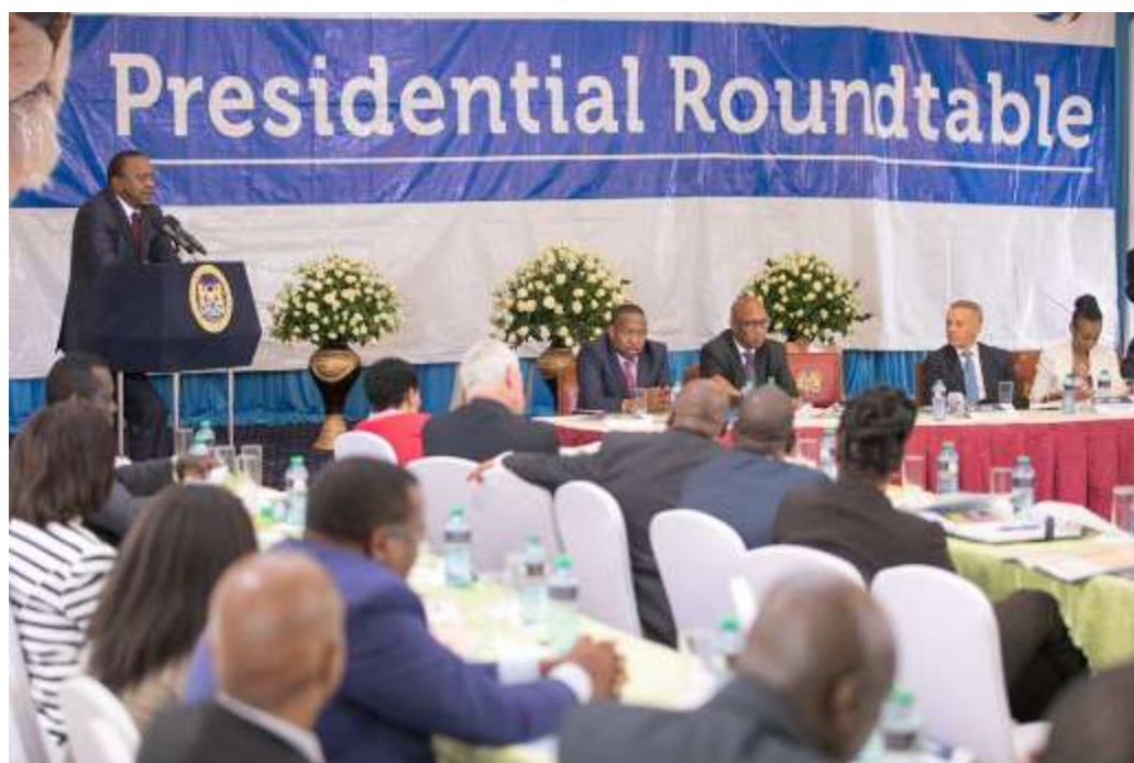
H.E. President Uhuru Kenyatta addressing government officials and KEPSA members during the 8th Presidential Round Table held on 10th May 2018 at State House, Nairobi

K enya private sector alliance held the 8 th Presidential Round Table at statehouse Nairobi on 10 th May 2018, under the chairmanship of H.E President Uhuru Kenyatta. This was the first Presidential Round Table in the year 2018. The major focus was on the BIG 4 Agenda with an objective of structuring the way forward to strengthen private sector participation. This forum gave an opportunity for the Private Sector, to align it's business agenda with the government Agenda to enhance collaboration towards common goals.