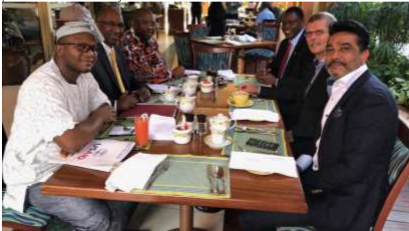
East Africa Healthcare Federation Team having a breakfast meeting during the USAID workshop