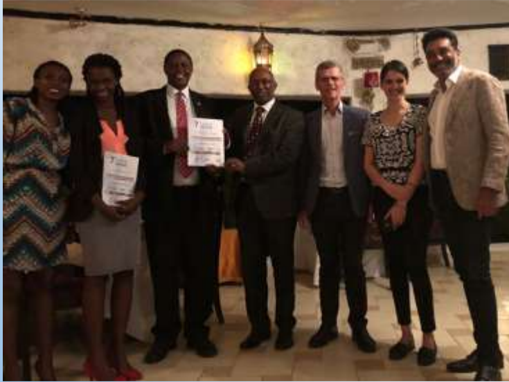
East Africa Healthcare Federation Team represented during the USAID workshop

Health Finance and Governance(HCG) a project of United States Agency for International Development (USAID) held an organizational workshop in Kampala, Uganda from 13 – 18 May 2018. The workshop brought together private sector in a panel discussion on 'Sustainable Financing for Expanding Quality Healthcare in Africa Workshop'.